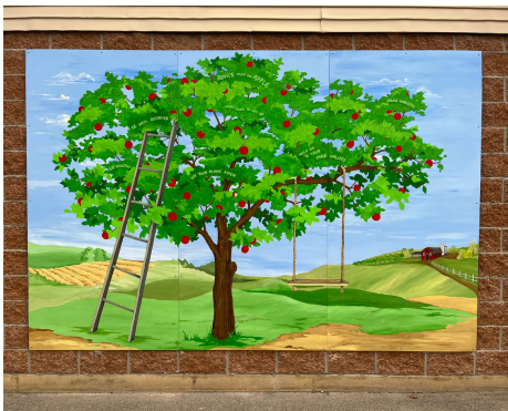
Mural by Mona installed on the Sparta Civic Center