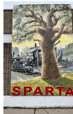
Mural by Sotir Davidhi installed on the Sparta Township Building